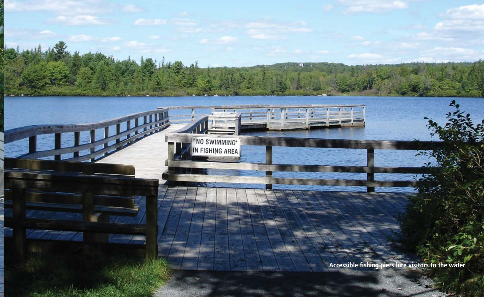
Accessible fishing piers lure visitors to the water

fishing piers hover on the tranquil lake, inviting visitors to leisurely enjoy hours of fishing in the autumn, spring and summer months. Bring a pair of binoculars with you and enjoy a comfortable stroll along one of the park's four accessible nature trails while looking for feathered inhabitants, plants and wild flowers. Please do not damage or remove them. Parking areas and drive-in picnic sites are conveniently located close to all facilities including a barrier-free vault toilet.