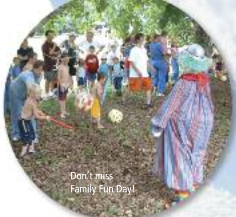
Don't miss Family Fun Day!

Plan to visit again in the fall, when the maples, birches and beeches don their autumn colours, producing a crazy quilt of reds, golds, oranges and yellows. You can also stop by in winter to enjoy cross-country skiing and snow shoeing.