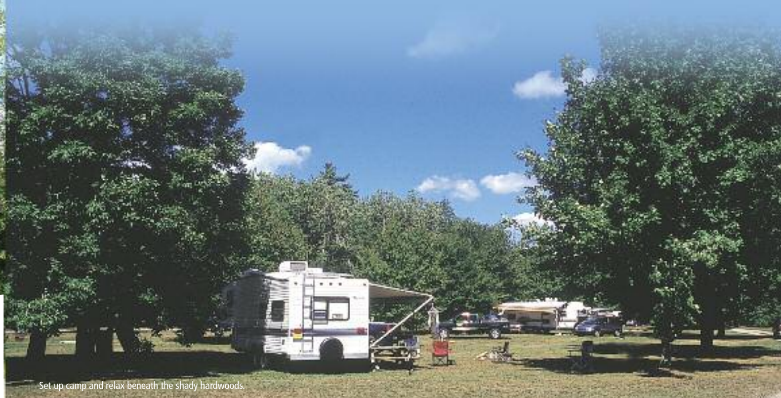
Set up camp and relax beneath the shady hardwoods.