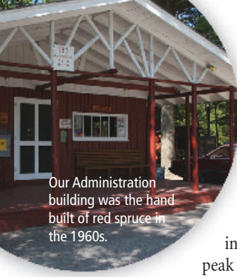
Our Administration building was the hand built of red spruce in the 1960s.