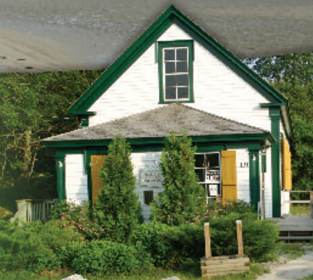
Visit nearby Birchtown

The barrens and bogs of southwest Nova Scotia have a beauty of their own. They provide necessary food sources for animals like black bear and moose, and support some rare plants. A feast for the eyes in the fall, the hills glow red with the changing foliage.